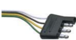
4-Way Flat Trailer Connector - *Most Common

4-Way connectors are available allowing the basic hookup of the three lighting functions (running, turn, and brake) plus one pin is provided for a ground wire.