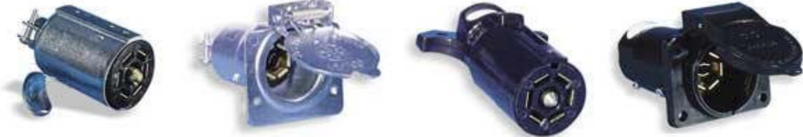
7-Way Trailer End

Besides the three main lighting functions, additional pins for auxiliary power, trailer battery charging etc. are available.