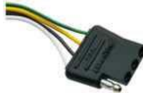
4-Way Flat Vehicle Connector